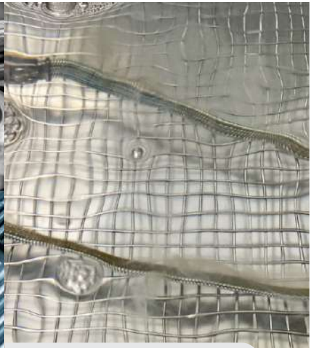
Gems & Jewellery